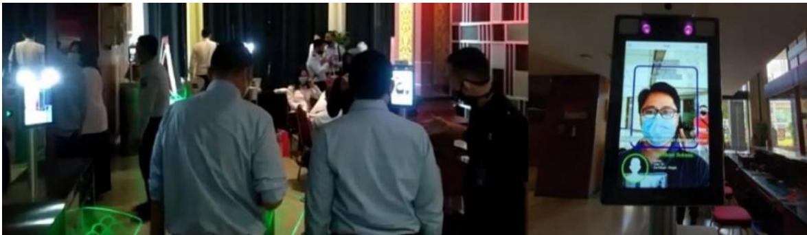
Fig. 1. Smart Detection Solution at the Ministry of Law and Human Rights office

Secondly, DMMX will partner with PT Transportasi Jakarta (Transjakarta) and PT Multidaya Dinamika (“MDD”), subsidiary of PT Distribusi Voucher Nusantara Tbk (DIVA), to launch KasirKu, an interactive self-service transaction kiosk to purchase e-money cards and perform top-up services. The digital kiosks come equipped with DMMX's cloud-based advertising infrastructures, hence providing additional value-added experience to Transjakarta bus stations commuters. This joint initiative is in line with ongoing Government efforts to encourage people to observe social distancing and reduce direct interaction with one another.