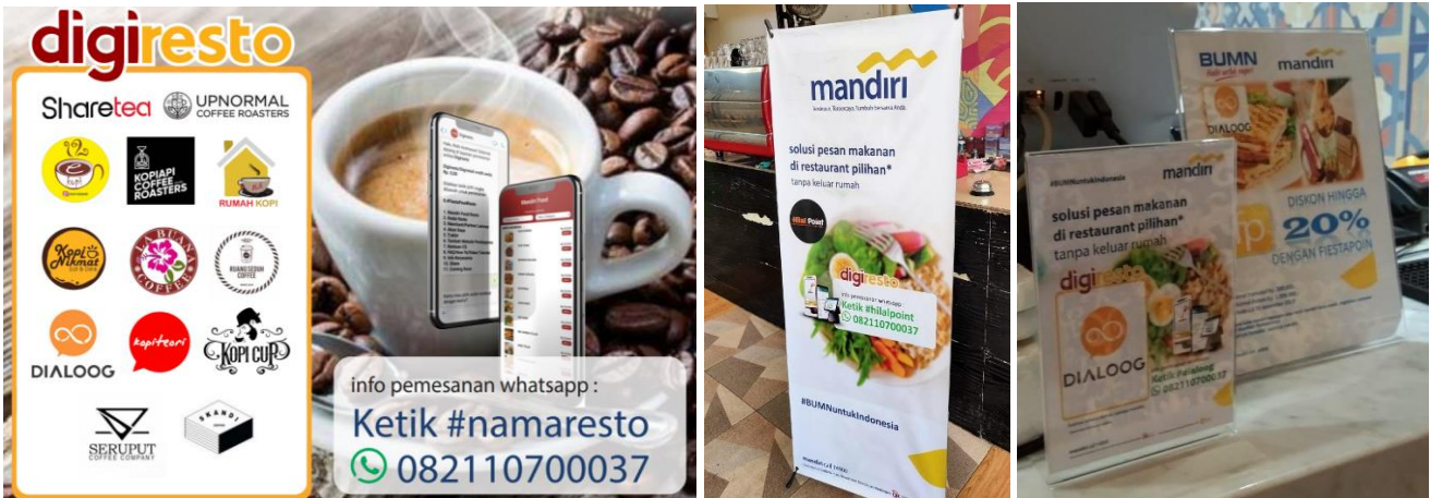
Figure 4: DigiResto softlaunch, in cooperation with Mandiri