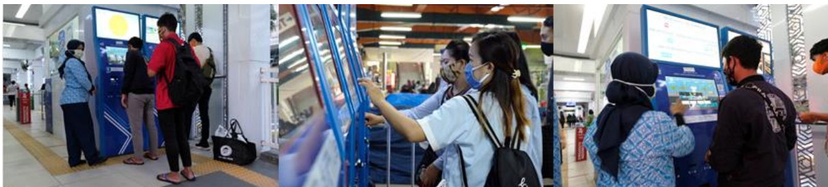
Figure 2: KasirKu deployed at Transjakarta Stations

The two new initiatives demonstrate the scalability and sector-agnostic nature of the Group’s digital ecosystem. More importantly, such developments are important steps to improve the natural use-case of the Group’s ecosystem. Moving forward, the Group will continue leveraging on its capabilities and continue forging practical partnerships with segments of the economy that see the benefit of embracing digitalization.